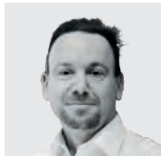
Dr Geoff Mulgan

President of the Board of Trustees of Calouste Gulbenkian Foundation – Portugal