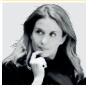
Ms Monica Maggioni

Former Chairman of the National Assembly of Bulgaria, former Deputy Prime Minister and former Member of the European Parliament – Bulgaria