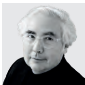
Professor Manuel Castells Minister of University of the Spanish Government and Sociologist – Spain