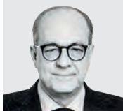
Professor Paolo De Castro Member of the European Parliament, former Minister of Agriculture of Italy - Italy