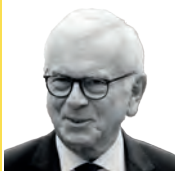
Dr Hans-Gert Pöttering

Member of Slovak Parliament and former Member of the European Parliament – Slovakia