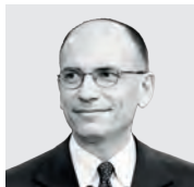
Mr Enrico Letta

National Secretary of the Italian Democratic Party, Founder of Scuola di Politiche in Italy and former Dean of the Paris School of International Affairs (PSIA) at Sciences Po in Paris – Italy