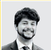
Mr Brando Benifei Member of the European Parliament, President of the Spinelli Group and Vice President of the European Movement International – Italy