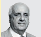
Mr Étienne Davignon President of Friends of Europe and former Vice-President of the European Commission – Belgium