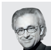
Professor Antonio Damasio University Professor, David Dornsife Professor of Neuroscience, Professor of Psychology, Professor of Philosophy, and Director of the Brain and Creativity Institute at the University of Southern California