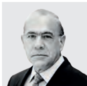
Mr Angel Gurría Former Secretary General of the OECD – Mexico