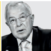
Mr Alain Lamassoure Former Member of the European Parliament – France